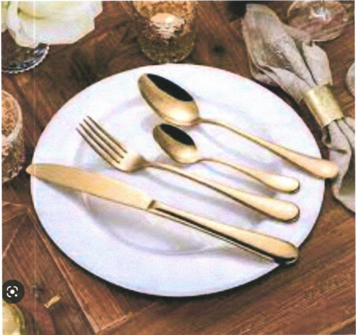
Set/ Spoon Fork Knife Dessert spoon Set | Lazada PH